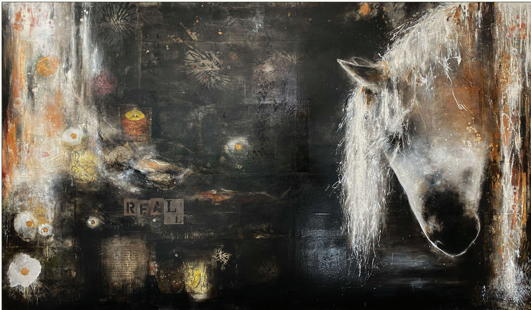
Wisdom Of The Flower 55x96x3 mixed media on panel - Sandra Meyer

This is the third piece from Sandra Meyer's REAL series that continues to tell the story of the final stage of growth, The Wisdom Of The Flower. It leaves the viewer with striking images of the Skin Horse, the wisdom of a calming flower, and finally the healing tears of growth. Infused with original book pages, "Wisdom Of The Flower" shares the story of the The Velveteen Rabbit.